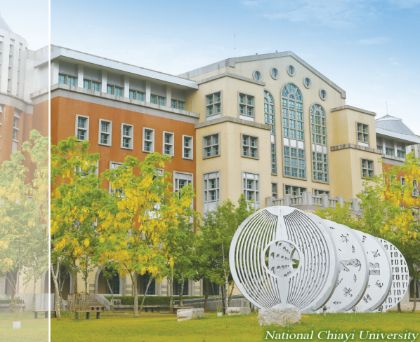
National Chiayi University