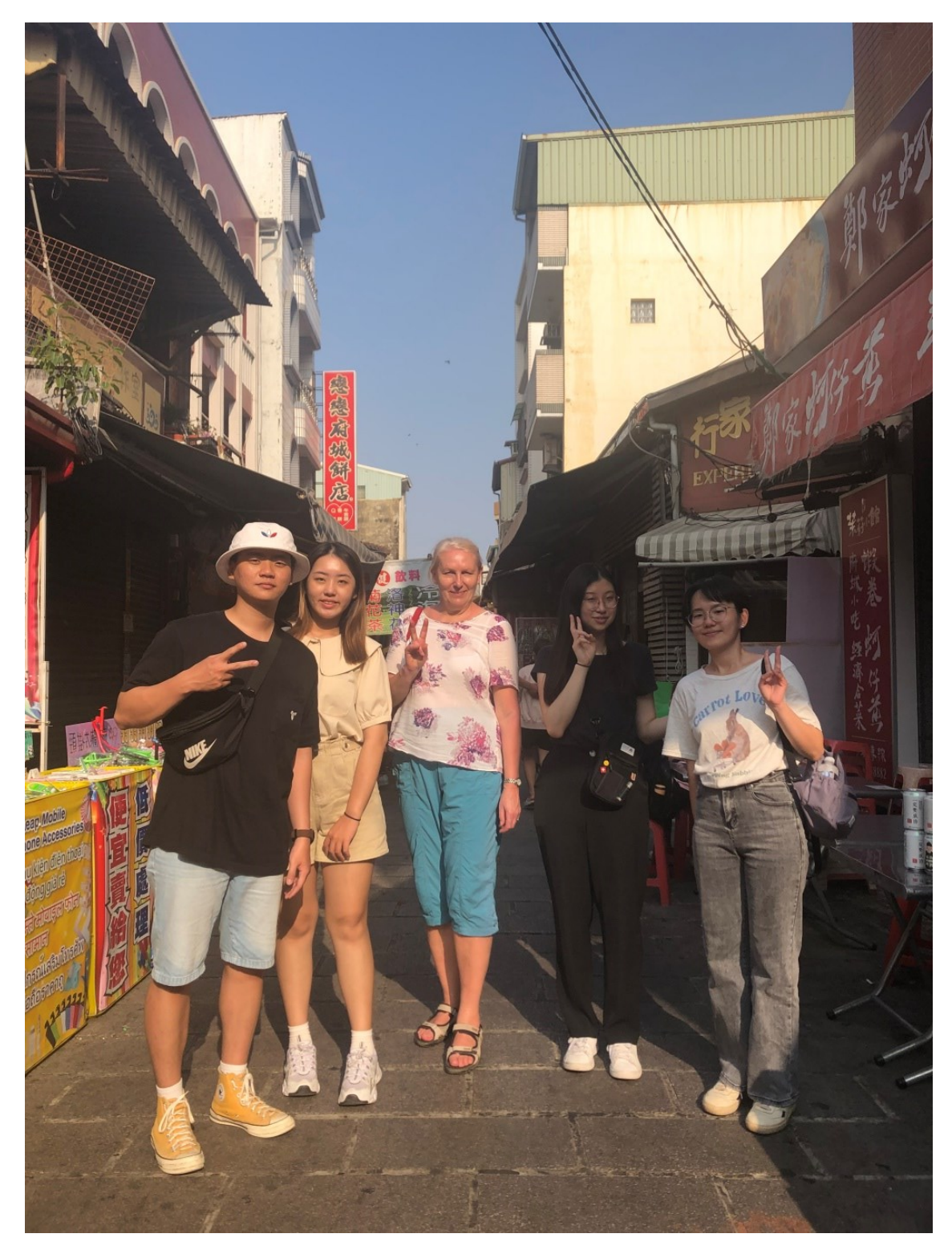
Tainan - Taiwan's oldest city