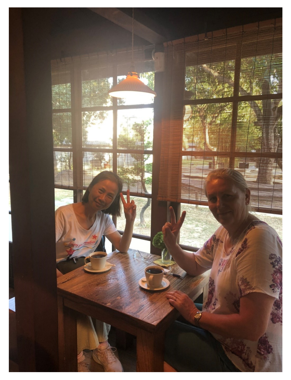
Hinoki Village. Japanese tea house.